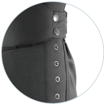
Detail of belt with snaps.