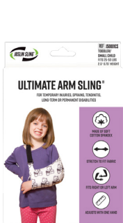
Toddler/Small Child #J50001CS

Fits 25 - 50 lbs / 2.5" - 3.75" 12-23kgs / 80-115cm