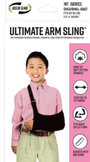
Child/Small Adult #J50101CS

Fits 25 - 50 lbs / 2.5" - 3.75" 12-23kgs / 80-115cm