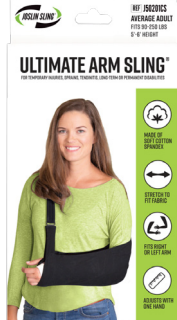
Average Adult #J50201CS

Fits 50-90 lbs / 3'5" - 5' tall 23-41kgs / 106-152cm tall